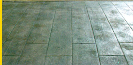
Nuss Brown, Wood Deck Stamp