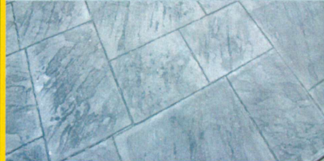
Granite Rock, Slate Stamp