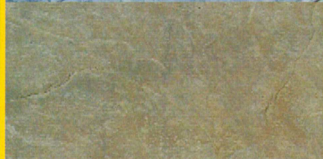
Amber Rose, Marble Stamp