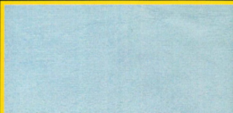
Plain, Broom Finish

Many techniques, patterns and colours available. Below are just a few ideas