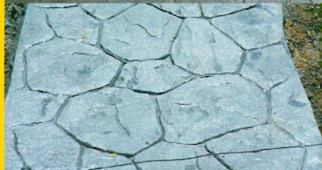
Boulder, Random Stone Stamp

With the innovation of in-floor heating, concrete has now also become a popular choice for the inside décor as well as the outside.